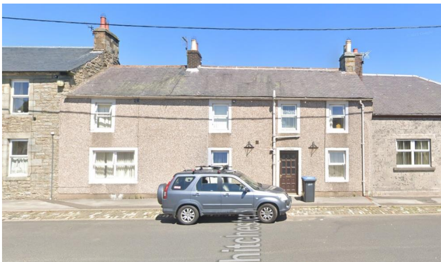
Front Elevation onto Douglas Square