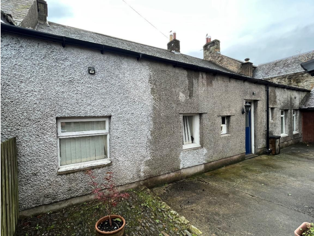
Figure 1: Rear of property