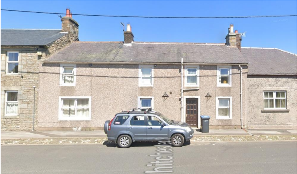
Figure 2: Front of property